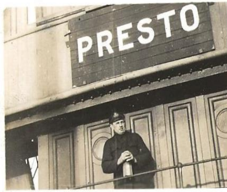
On Board SS Presto