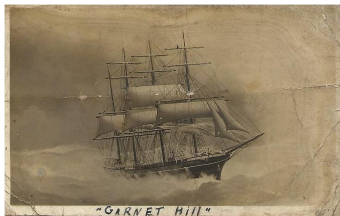
The Pocket Book is inscribed by Timothy with Ship :Garnet Hill Glasgow