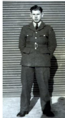
Sergeant 530722. 228 Squadron, Royal Air Force

He flew Sunderlands and took part in the first air sea rescue of a torpedoed ship the Kensington Court. He was stationed at Uxbridge, Scotland, Pembroke Dock, Alexandria, Gibraltar, and finally Malta.