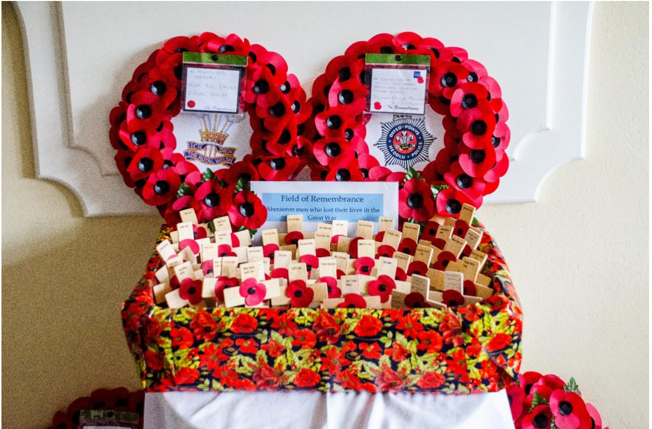
Poppy Wreaths Presented at Armistice Day Commemoration 11.11.2014