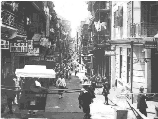
Street Scene in Hong Kong